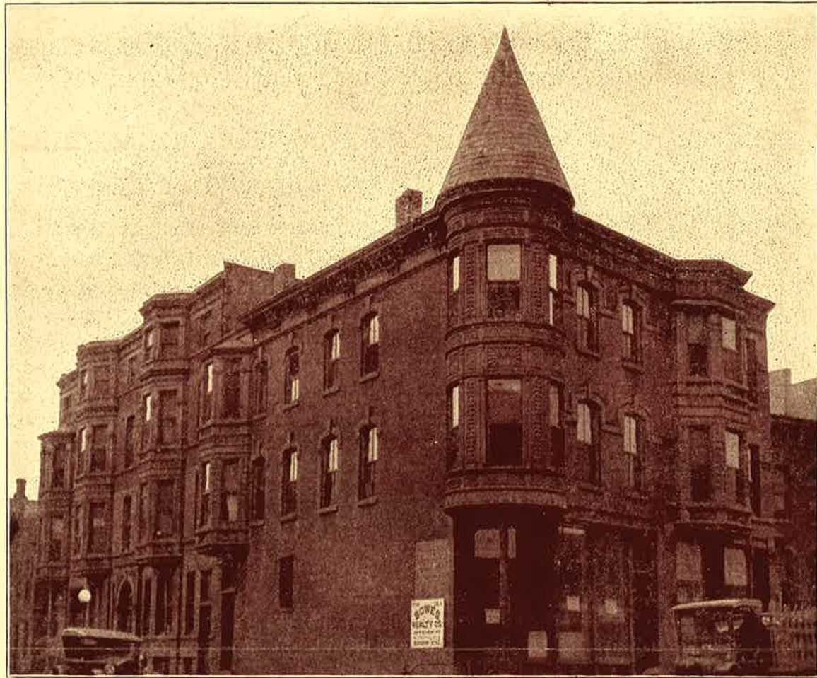
As the buildings at the Southeast corner of Walton Place and Rush Street look today.